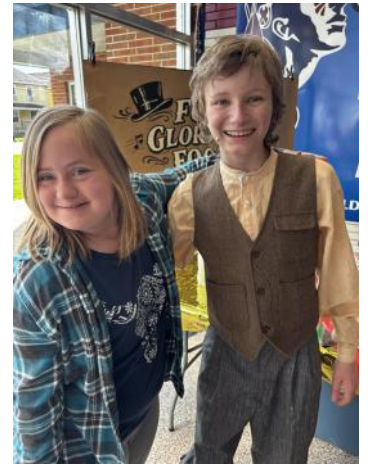
The Arc STEP group attend Shikellamy High School's play, "Oliver."

And to everyone who came out to support The Arc during this fundraiser!! We raised $1,900 in cheeseburger sales and an additional $353 in baked good sales for a total of $2,253! All proceeds go toward our accessible van funds.