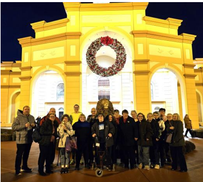
Sight and Sound Theater, Lancaster, "The Miracle of Christmas."