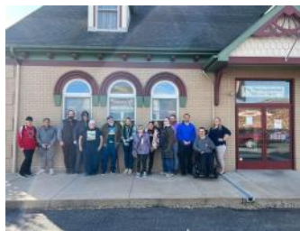
The Money Management Group visited the Northumberland National Bank.