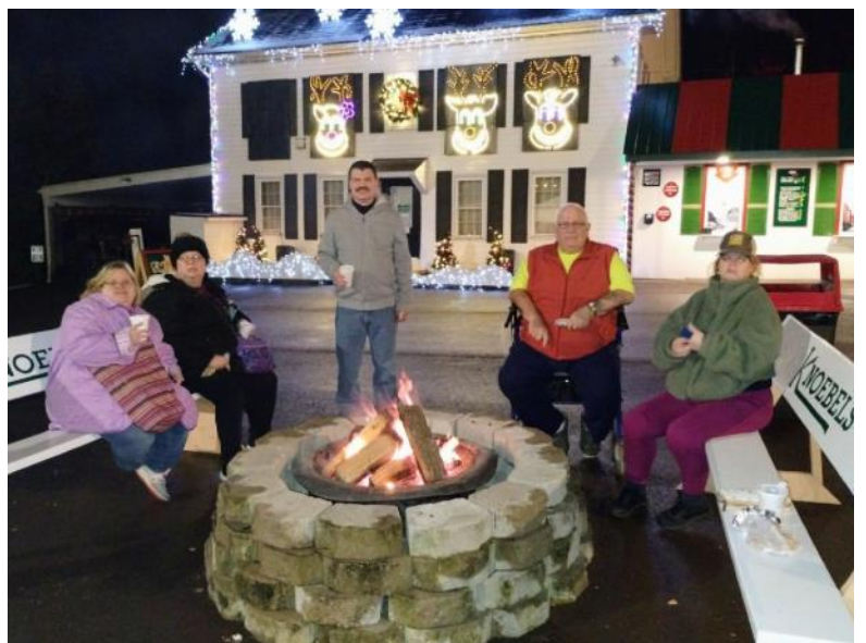
Bloomsburg AMPES visits Knoebel's "Joy Through the Grove!"