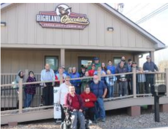
Toured Highland Chocolates in Wellsboro.