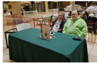
We participated in the Susquehanna Valley Mall's "12 Days of Gifting" event. We received a $200 donation for our Accessible Van Fund.